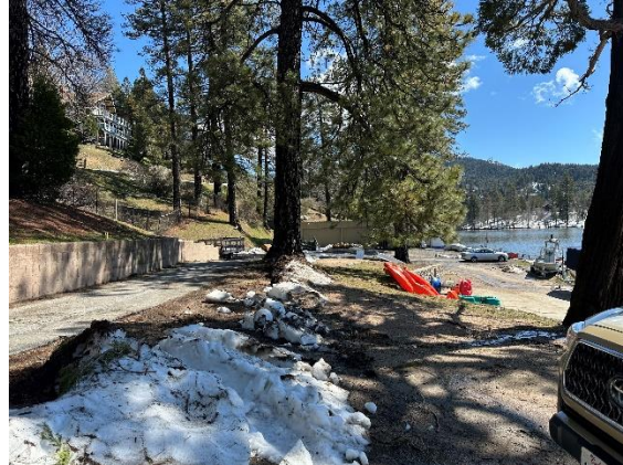
Existing access roadway and parking