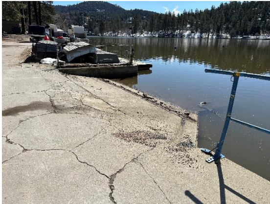
Existing boat launch ramp