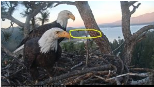
The proposed development site can be seen from the nest cam!

only ½ mile from their nest could eliminate the possibility of them continuing to nest here.