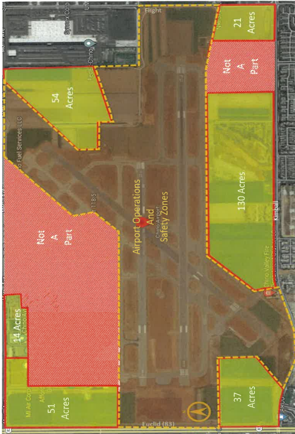
EXHIBIT "A" – SUBJECT PROPERTY (areas highlighted in yellow)