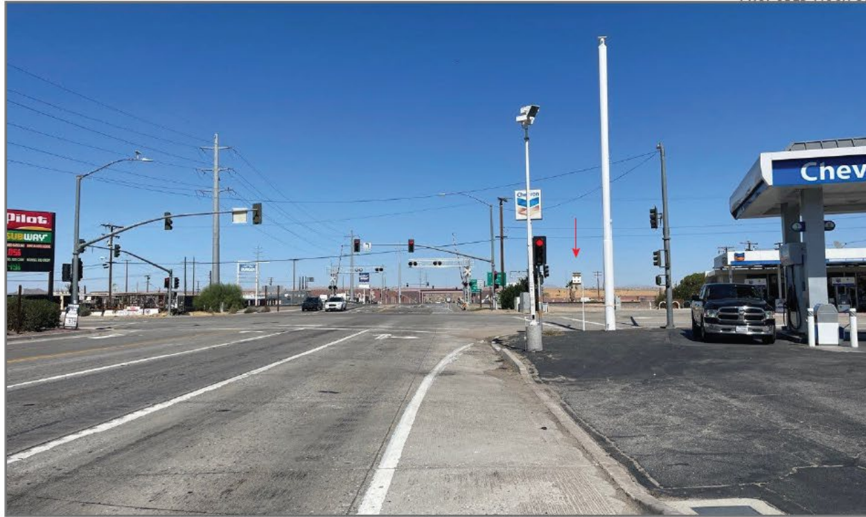
PROPOSED MOCK UP