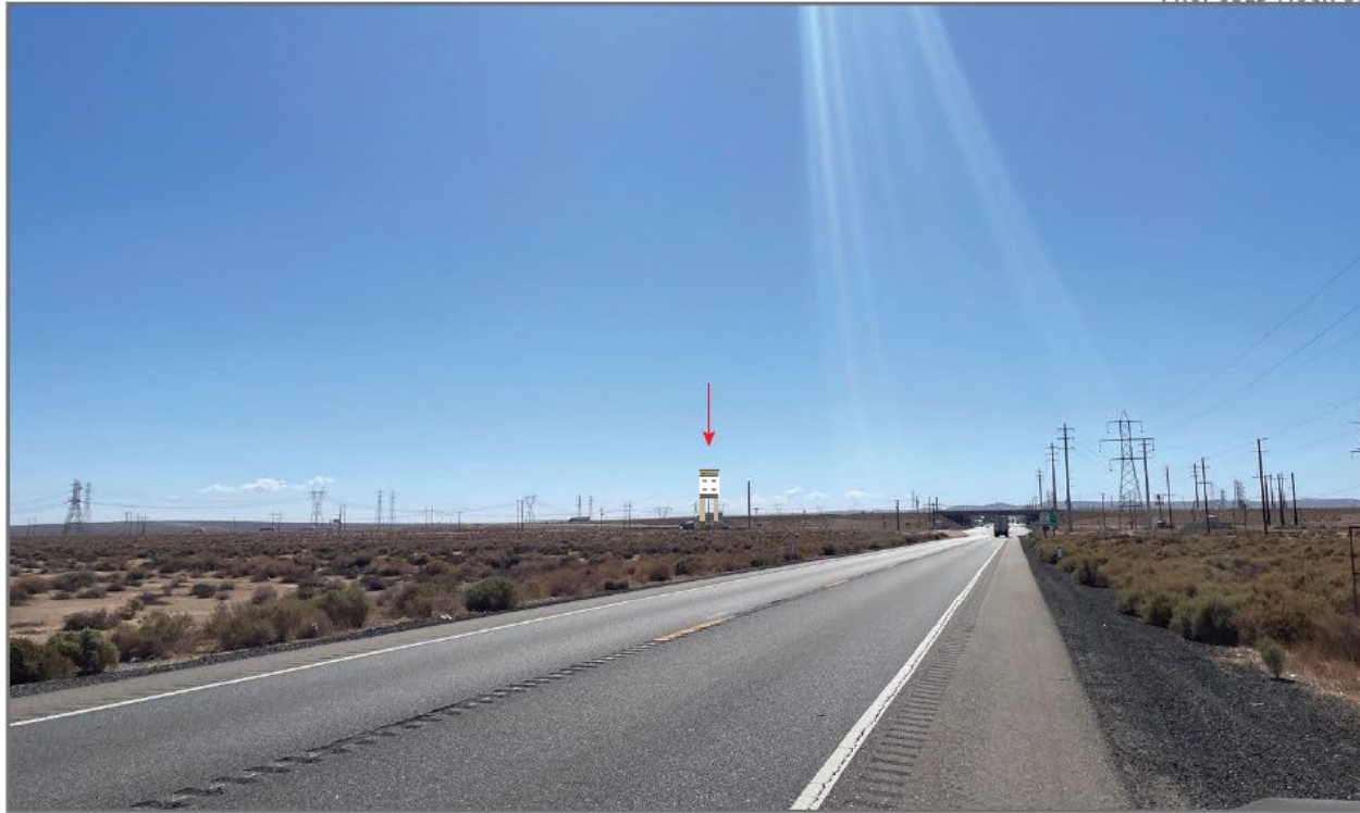
PROPOSED MOCK UP