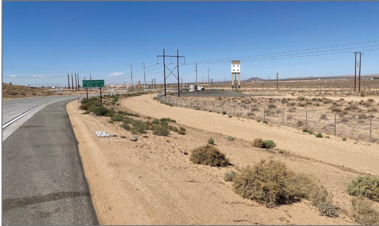
PROPOSED MOCK UP