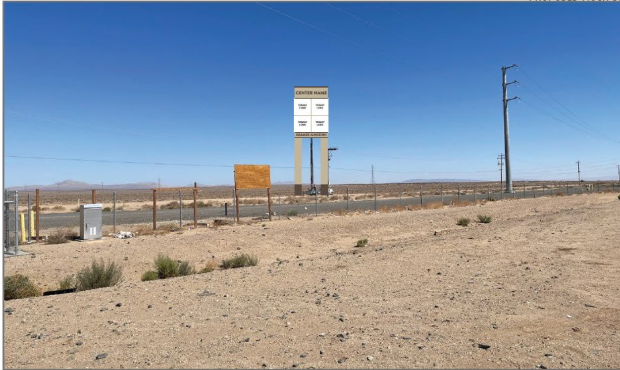
PROPOSED MOCK UP