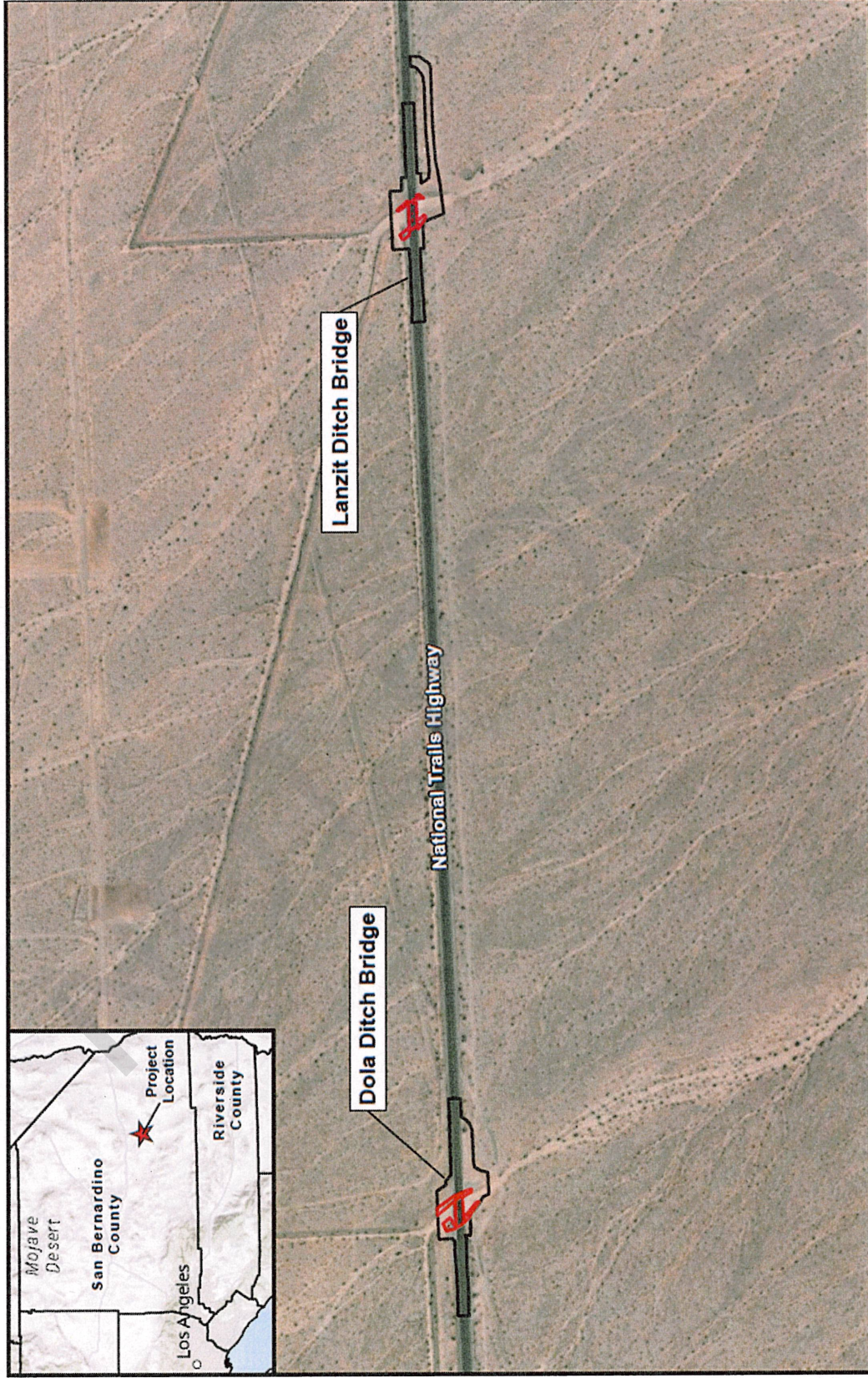
Figure 2: Project Location