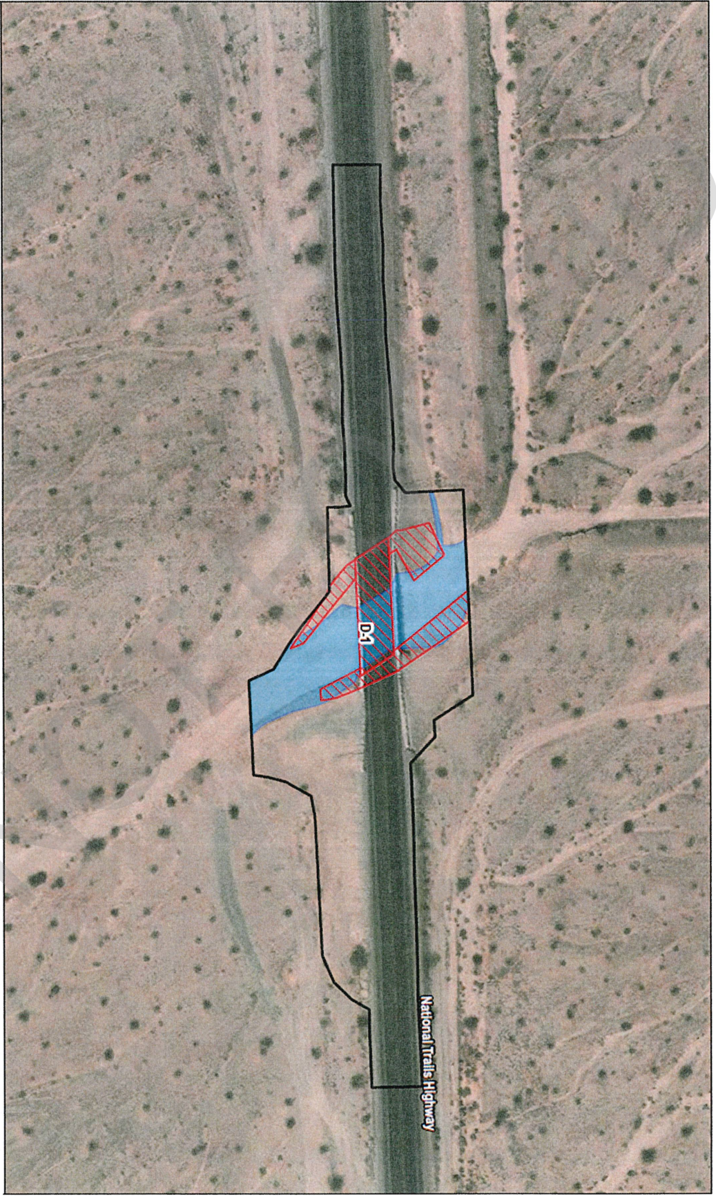
Figure 3: Dola Ditch Bridge jurisdictional features.