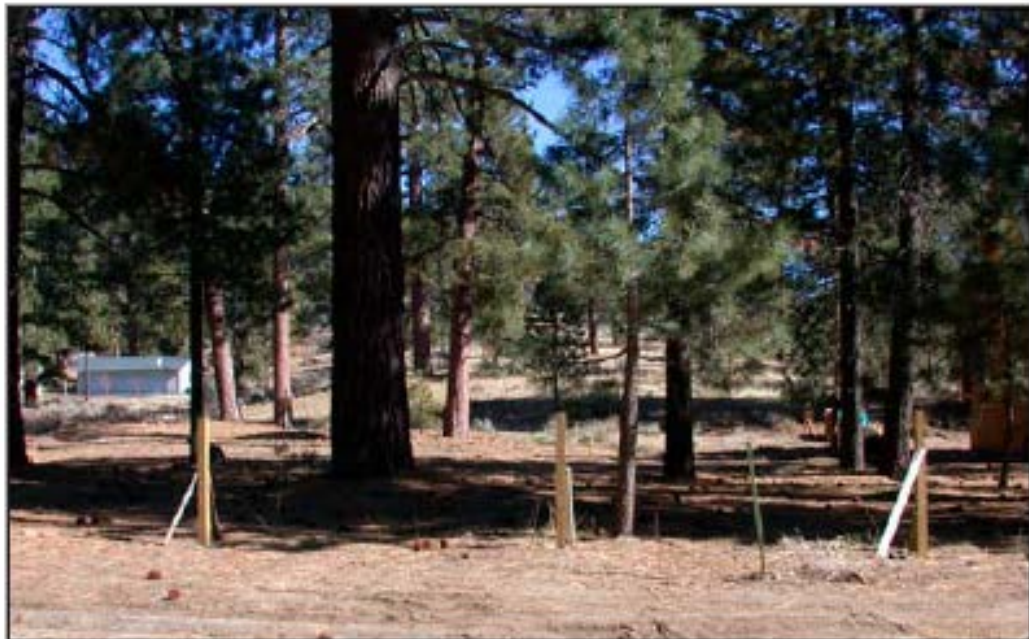
F Views of the project site from Oriole Lane located to the west of the project site.