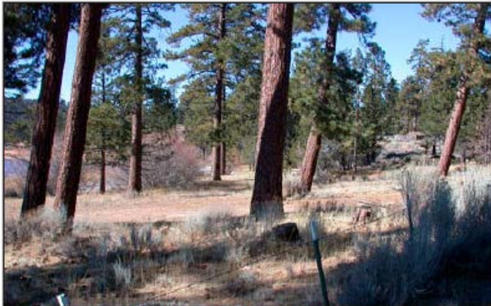
B View of Jeffrey Pine trees and associated vegetation on the project site.