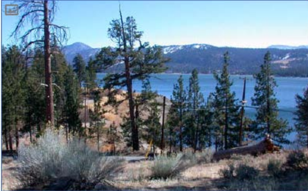
C Looking southerly from north of State Route 38 across the project site.