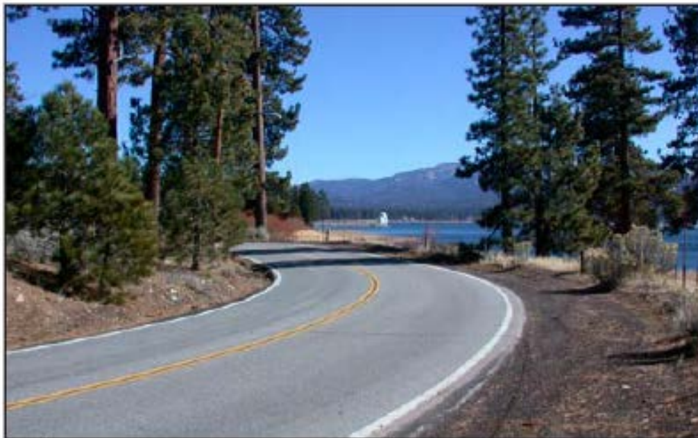
D View to the east along State Route 38.