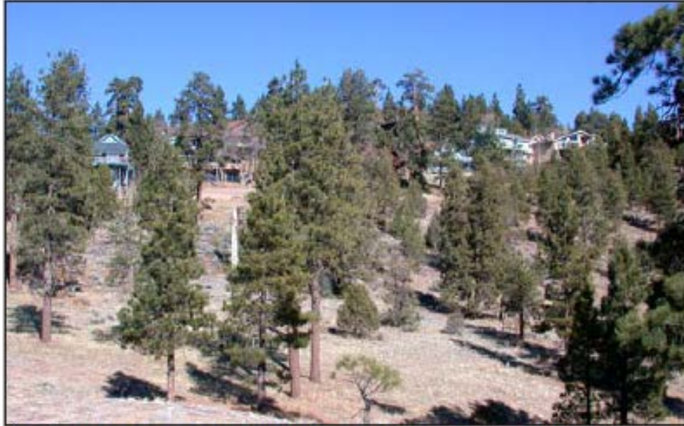
A From State Route 38, looking north. Existing vegetation and slope of mountainside.