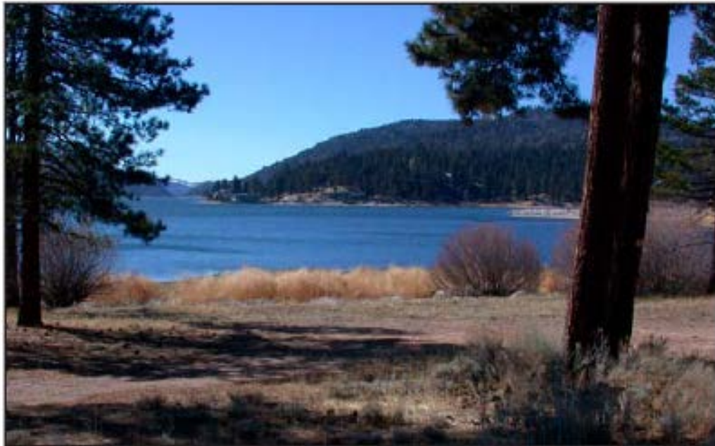
E Looking south westerly from State Route 38 across the lake.