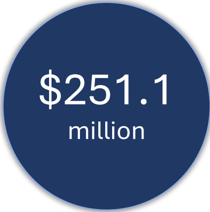
Estimated Fee Revenue for 2025-26