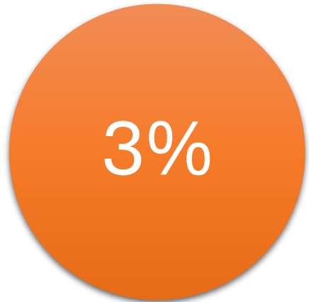
Fee Revenue is approximately 3% of the County's budget