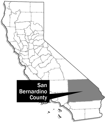
Fire Hazard Severity Zones (FHSZ) in Local Responsibility Area (LRA), as Identified by the State Fire Marshal