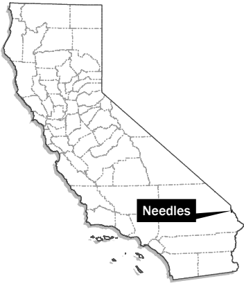
Fire Hazard Severity Zones (FHSZ) in Local Responsibility Area (LRA), as Identified by the State Fire Marshal