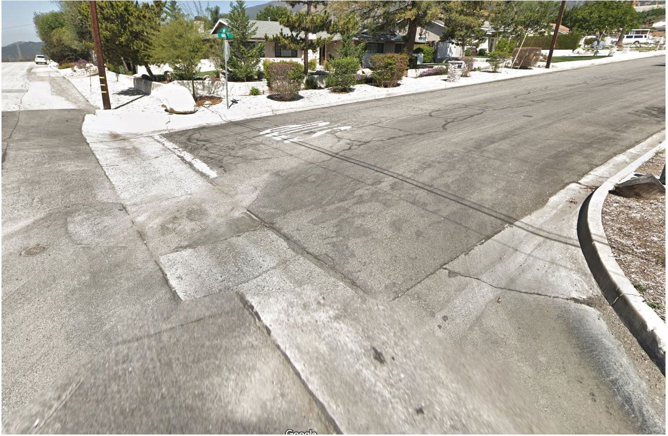
Figure 1. Damaged Existing Cross Gutter in 24th Street and Burt Street.