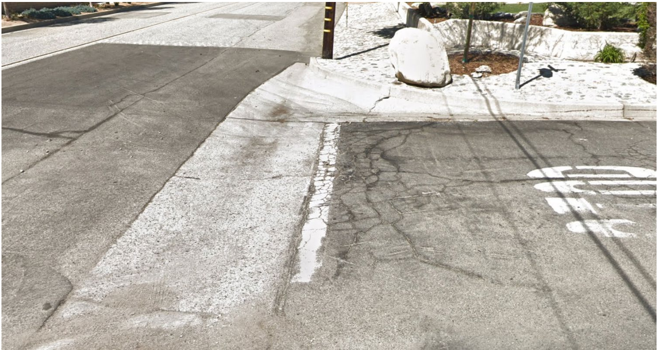
Figure 2. Damaged Existing Cross Gutter in 24th Street and Burt Street.