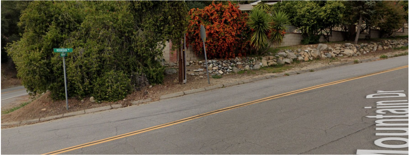
Figure 3. Existing AC dike at 2525 Mountain Drive.