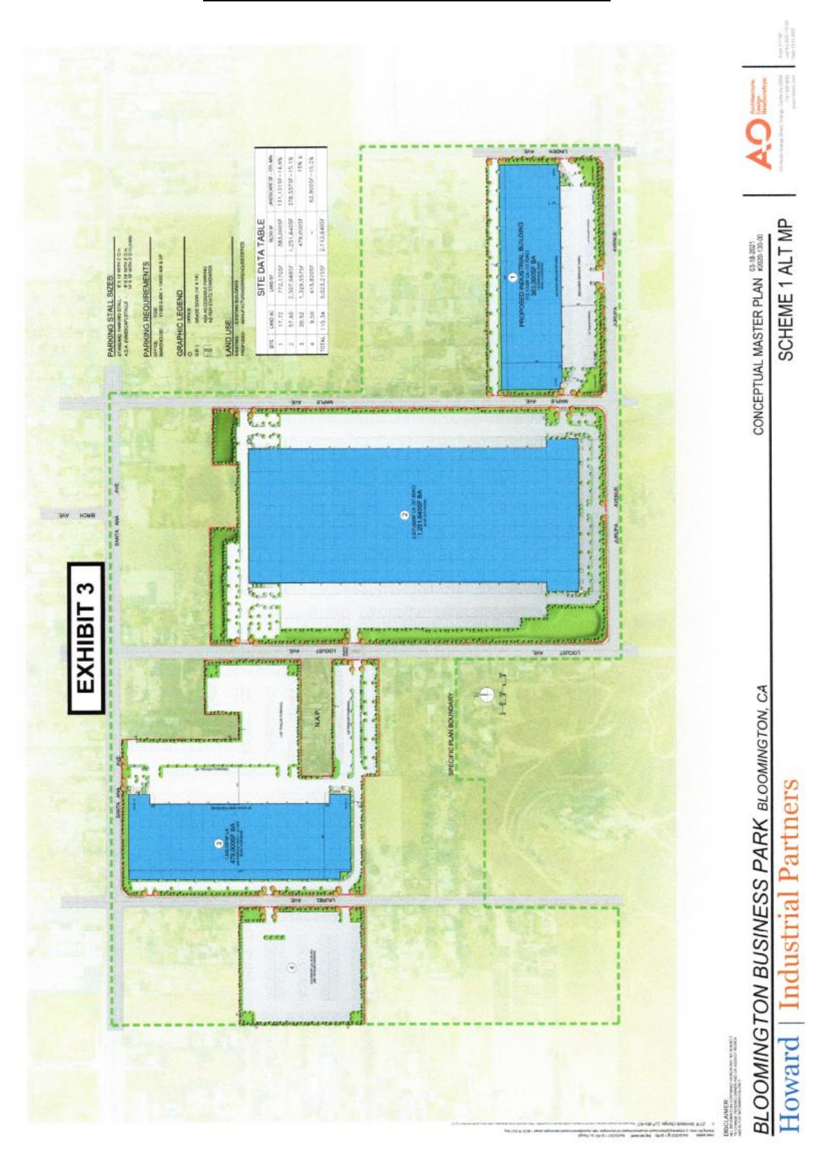
EXHIBIT 3 DEPICTION OF SPECIFIC PLAN AREA