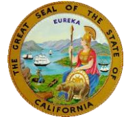
GAVIN NEWSOM GOVERNOR