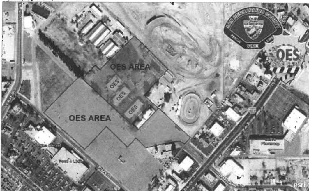
ACS-2 Use areas

USDA FSA | Esri Community Maps Contributors, City of Victorville, BuildingFootprintUSA, Esri, HERE, Garmin, SafeGraph, INCREMENT P, METU/NASA, USGS, Bureau of Land Management, EPA, NPS, US Census Bureau, USDA