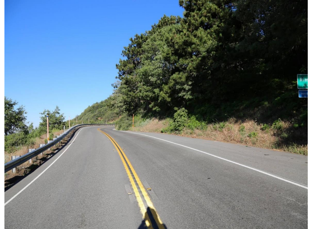
LOOKING WEST ALONG STATE ROUTE 18