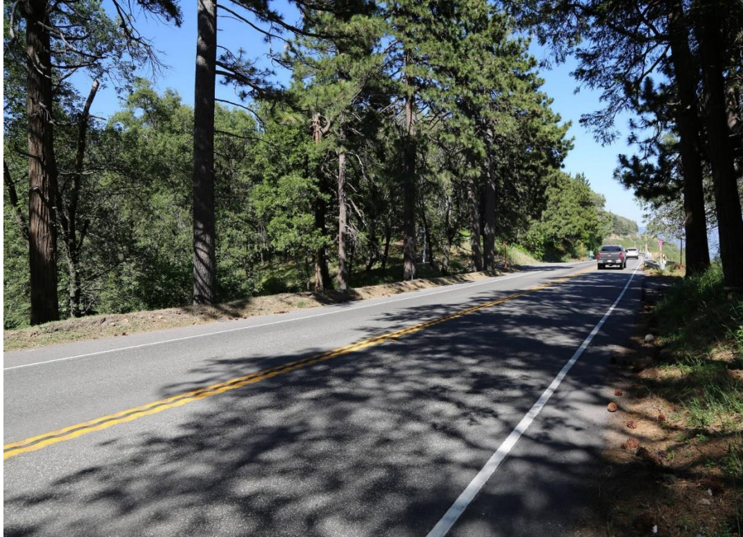
LOOKING EAST ALONG STATE ROUTE 18