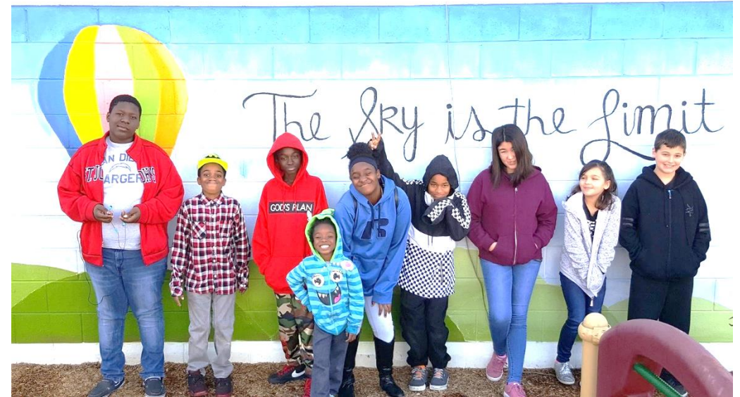
High Desert Homeless Services