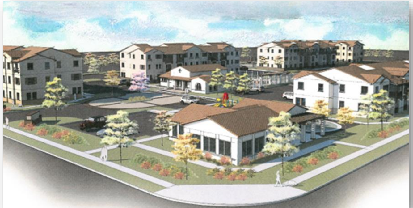
Las Terrazas Rendering