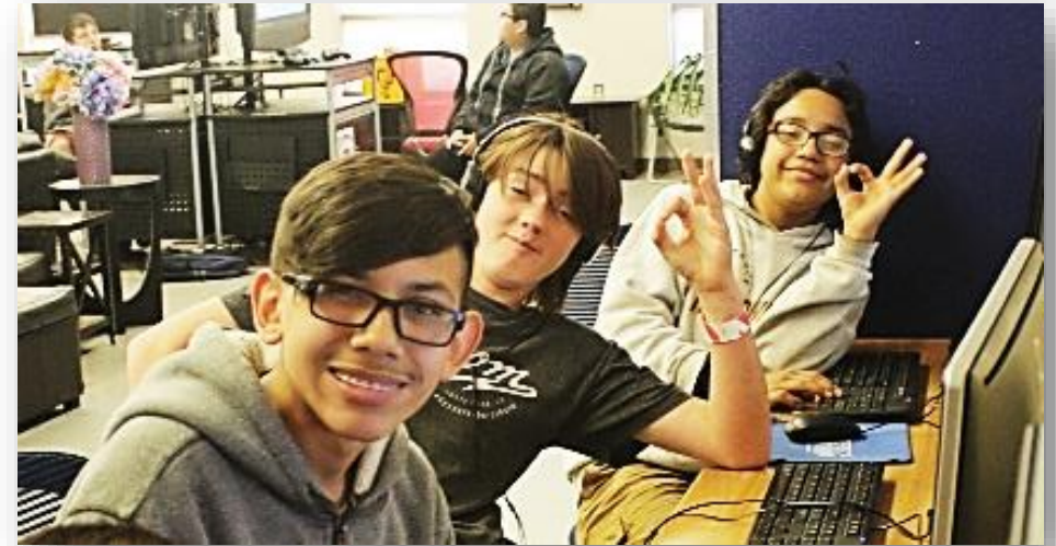
Colton – Teen Center