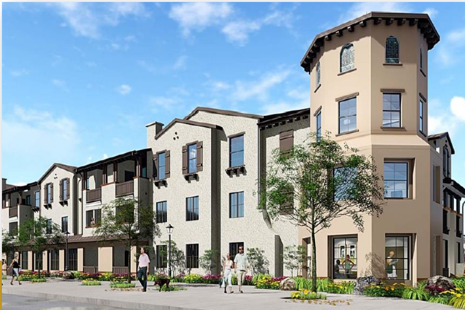
Bloomington Phase III- Rendering