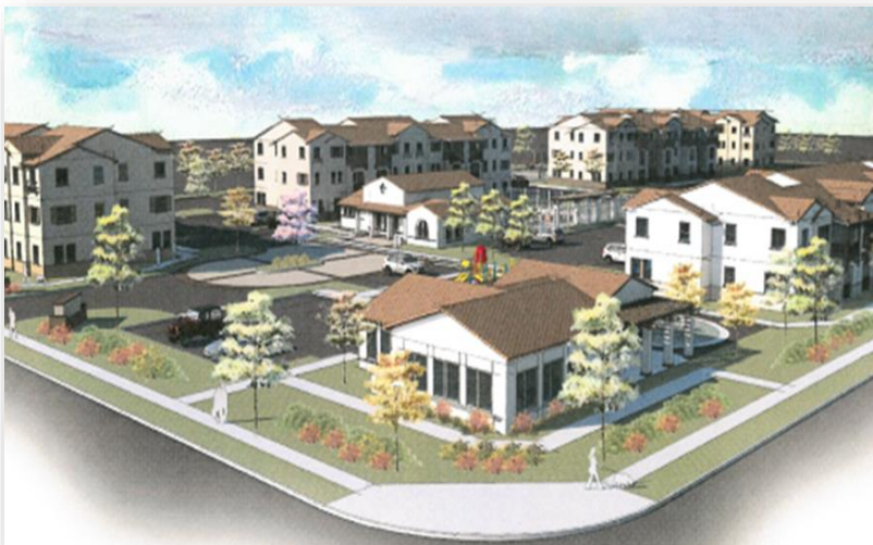
Las Terrazas Rendering