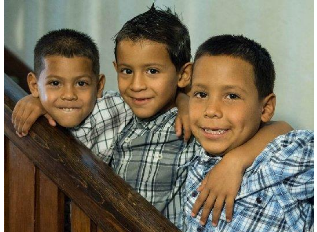
Service Provider - Inland Temporary Homes