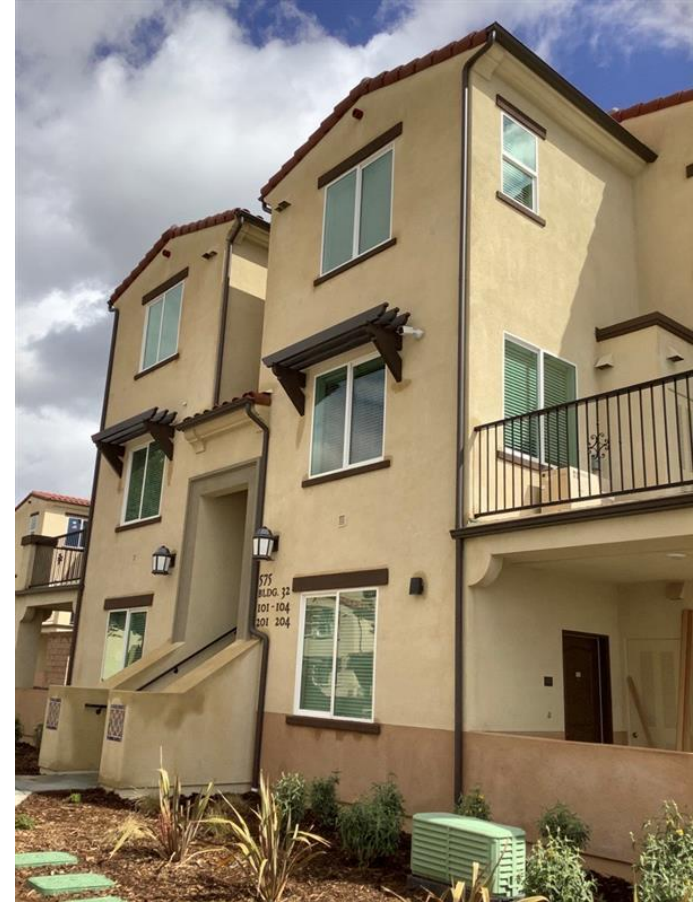
Arrowhead Grove Phase II