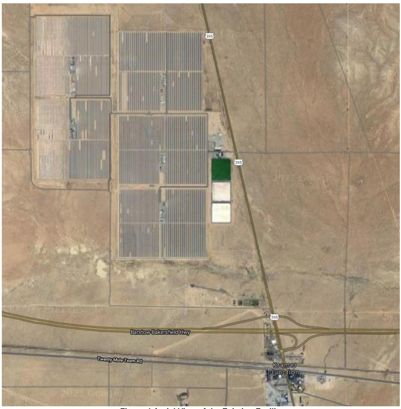
Figure 4 Aerial View of the Existing Facility