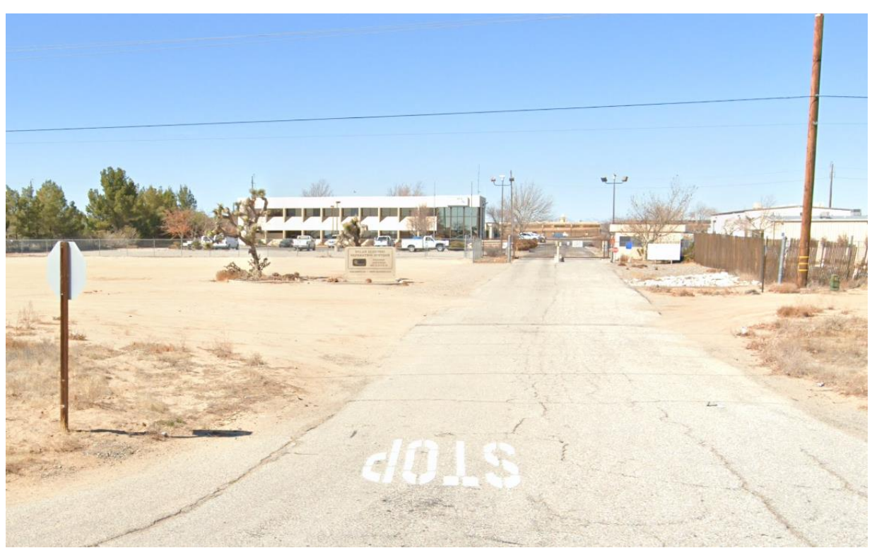
Figure 8 Entrance to Site