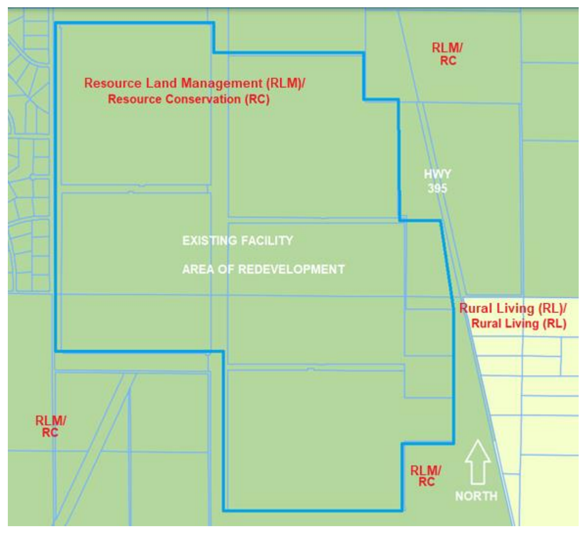
Figure 1 Land Use Designations and Zoning Designations