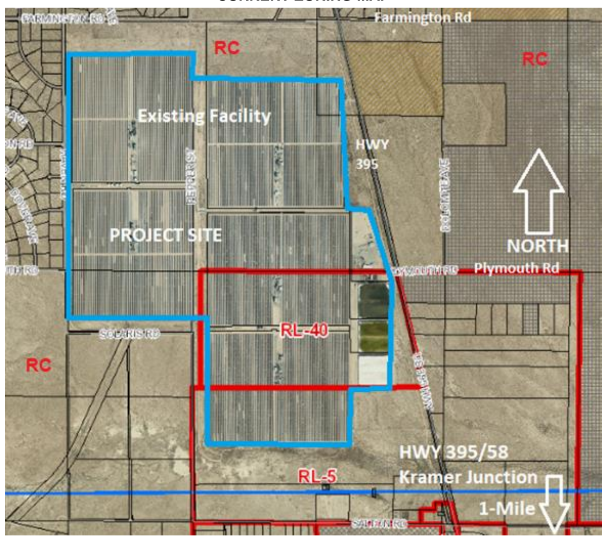
Figure 2 Zoning in Area of Proposed Reconstruction