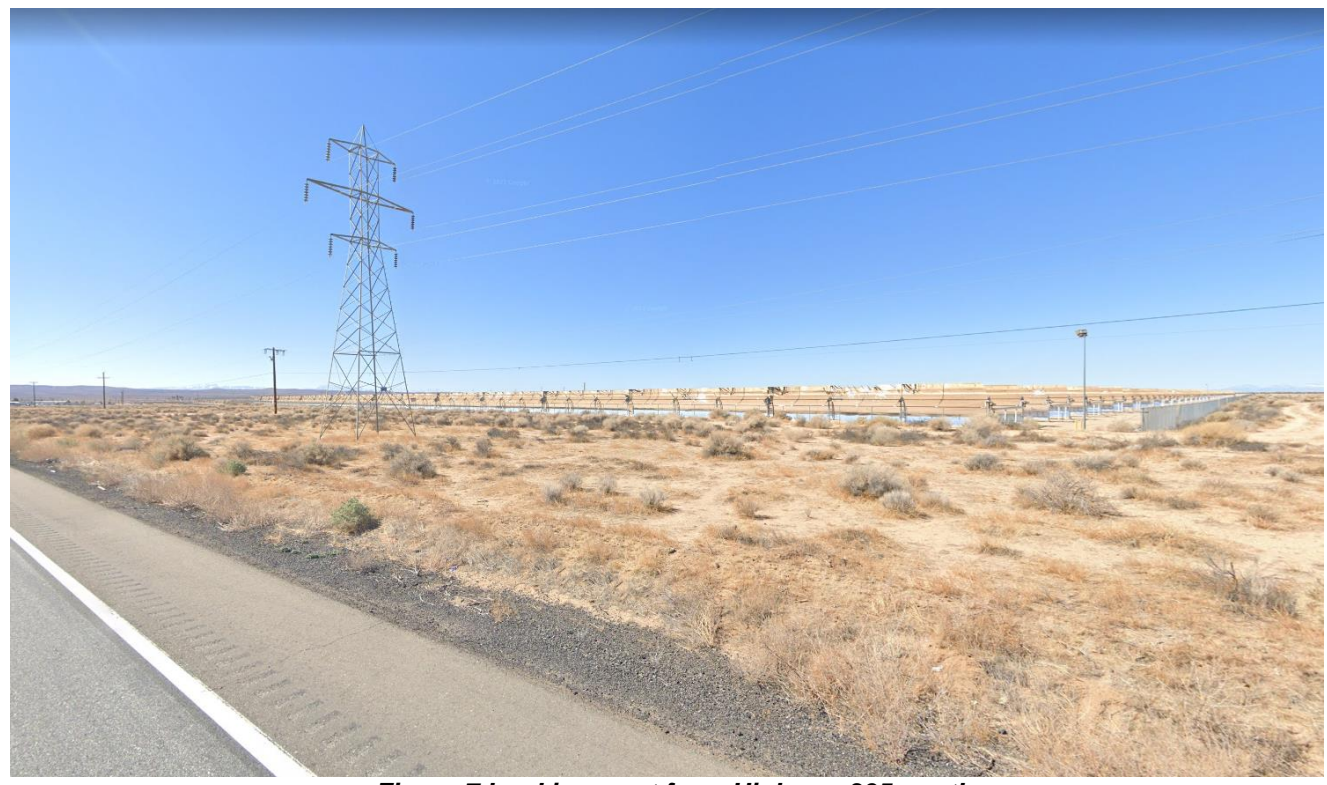
Figure 7 Looking west from Highway 395 south