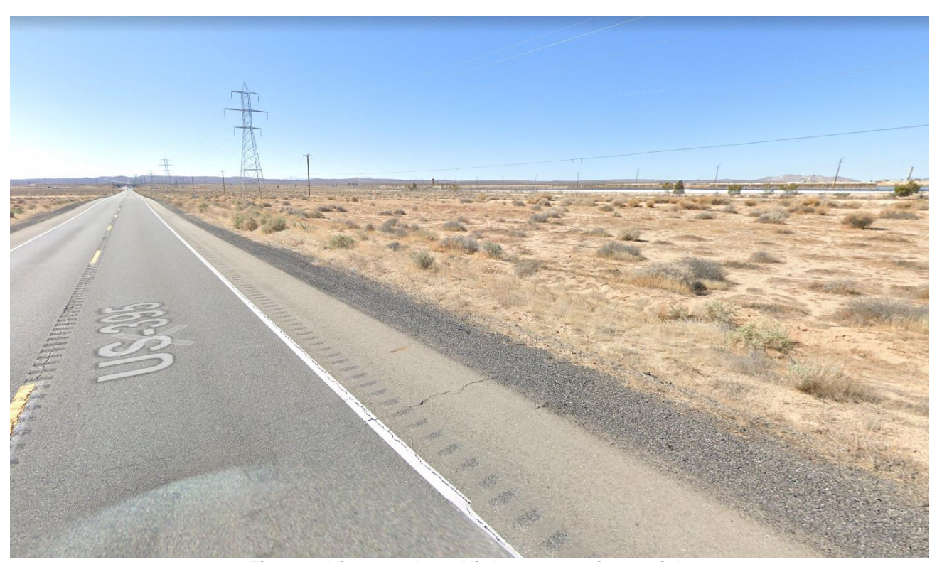
Figure 6 View south on Highway 395, site on right